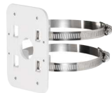
PFA152 Pole mount